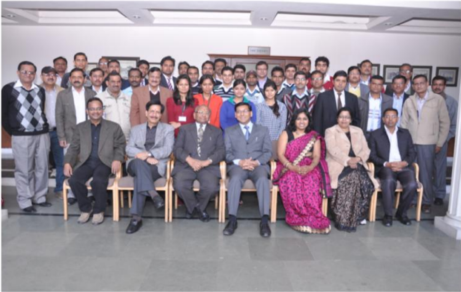
Cess Training programme on Trends in Processing and Papermaking of Recycled Fiber, Kashipur, February 20-21 , 2013.