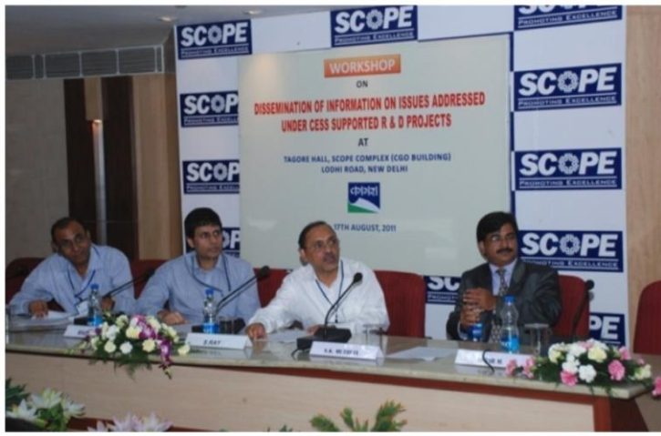
Cess Workshop 2011