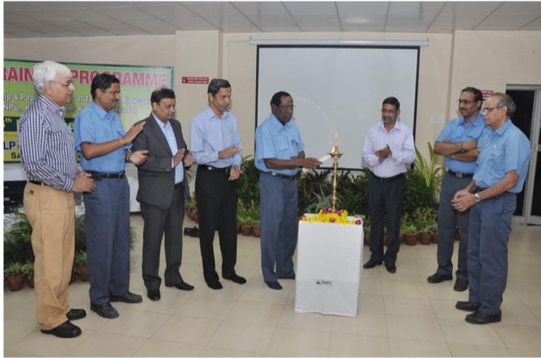
Cess Training Programme on Energy Management- Issues and Challenges, TNPL , November 05-06, 2012